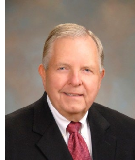
HOWARD SALMON CHAIR