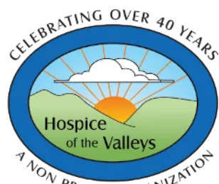
Hospice of the Valleys