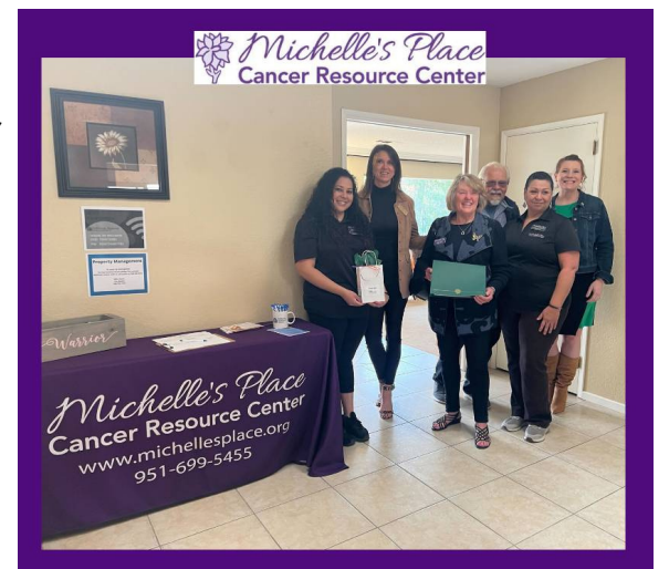
Michelle's Place Cancer Resource Center opens satellite office