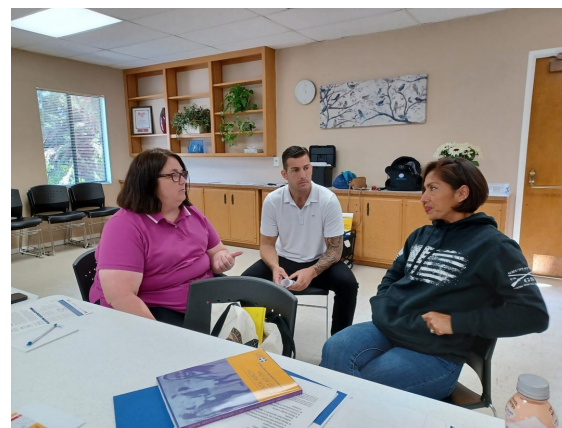
Mental Health First Aid Classes