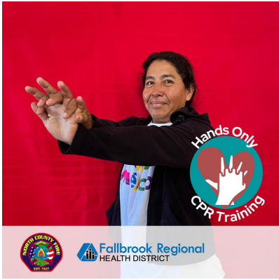
Hands Only CPR Classes