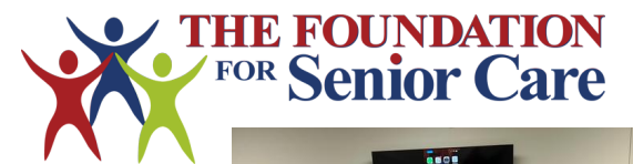
Senior Computer Learning Classes & Fix-It-Fridays