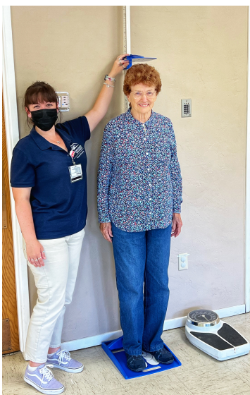
Wellness Wednesday screenings & workshops